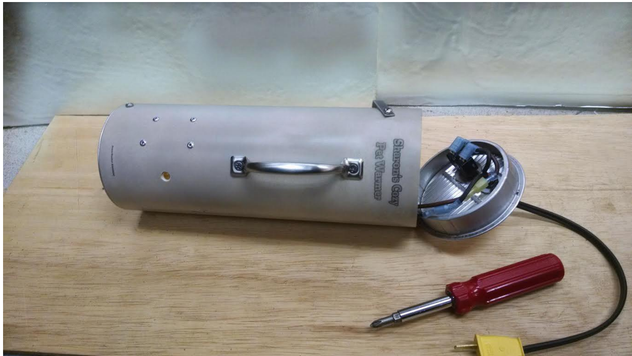
Figure 1 (Removing Retaining Screws):